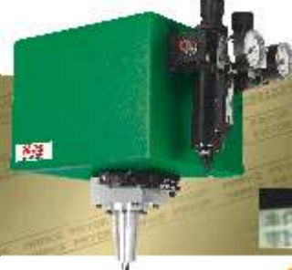
Hs Silentscribe Mark